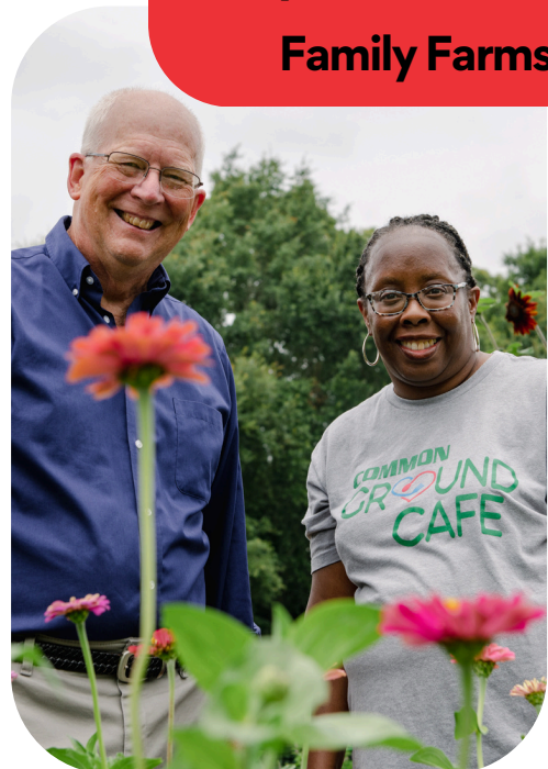
Boiling Springs Community Garden

For 2023, 25% of the foods used were sourced from Cleveland County farms and local gardeners, including but not limited to: Bridges Produce, Berry Fields, Greene Family Farm, Costner Farm, Mardet Family Farm, and Trinity Family Farms